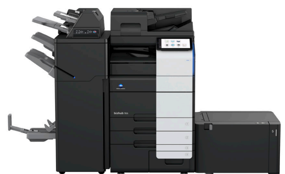
bizhub i-Series 750i