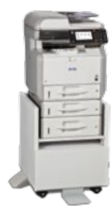
Standard Tray with one 250 and one 500 Sheet Tray