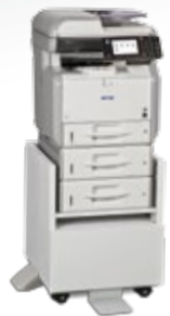
Standard Tray with two 500 Sheet Trays