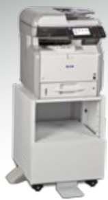
Standard 500 Sheet Tray