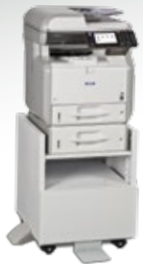
Standard Tray with one 500 Sheet Tray